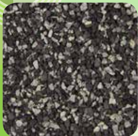
Pewter Gray CC010A