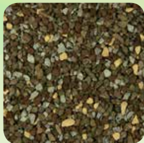
Weathered Wood CC004