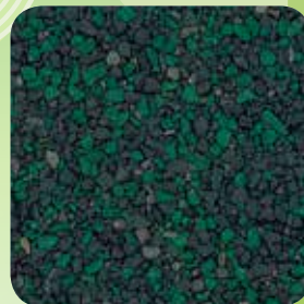
Yosemite Green CC074A